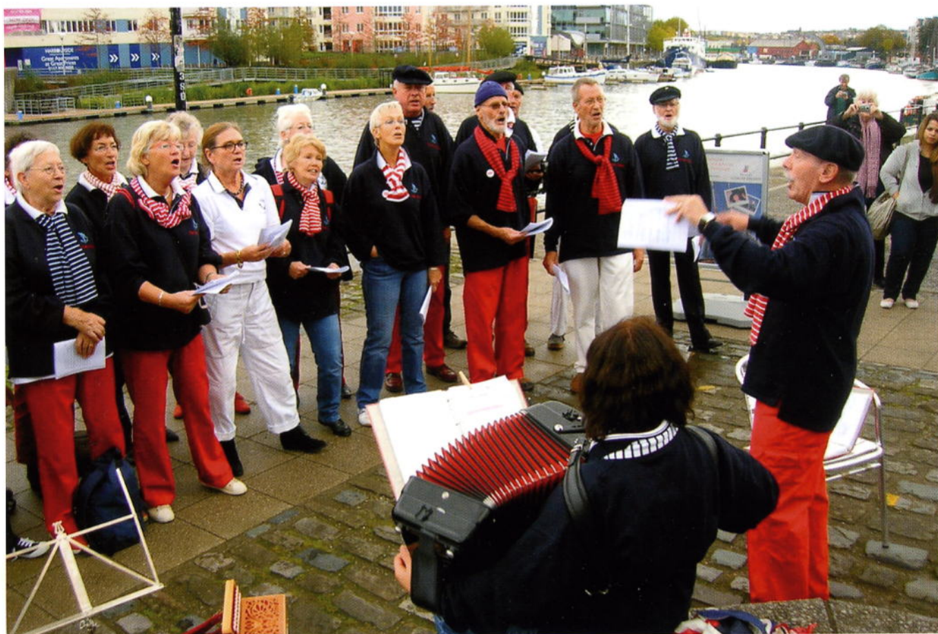
The Lake Singers perform on the Quayside in Bristol after visiting SS Great Britain.